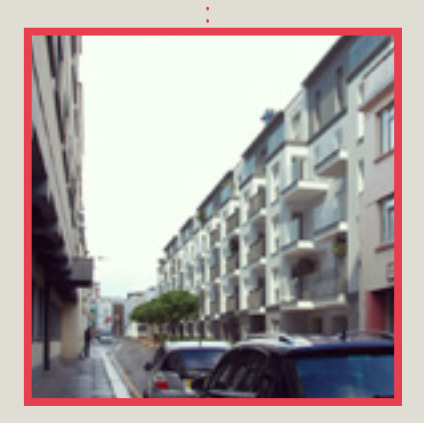
Stafford & Revere Hotels, St Helier 106 New Homes Due for Completion: 2025